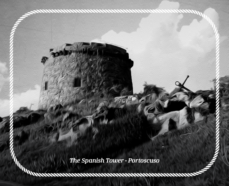
The Spanish Tower - Portoscuso